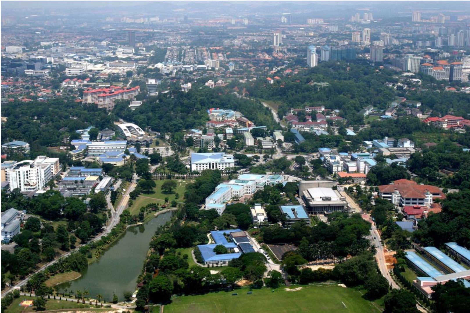
Aerial View of UM